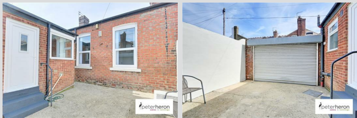
Small forecourt area to the front and a courtyard to the rear with remote control roller shutter access door.