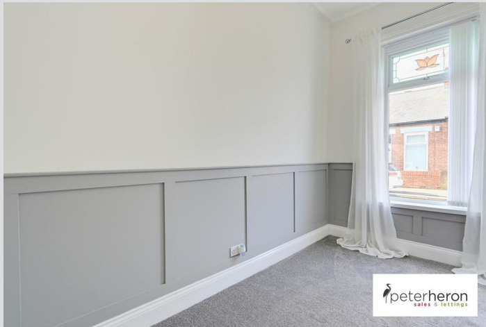
Double glazed window to rear, radiator and part paneled feature wall.